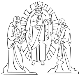
TRANSFIGURATION of the Lord